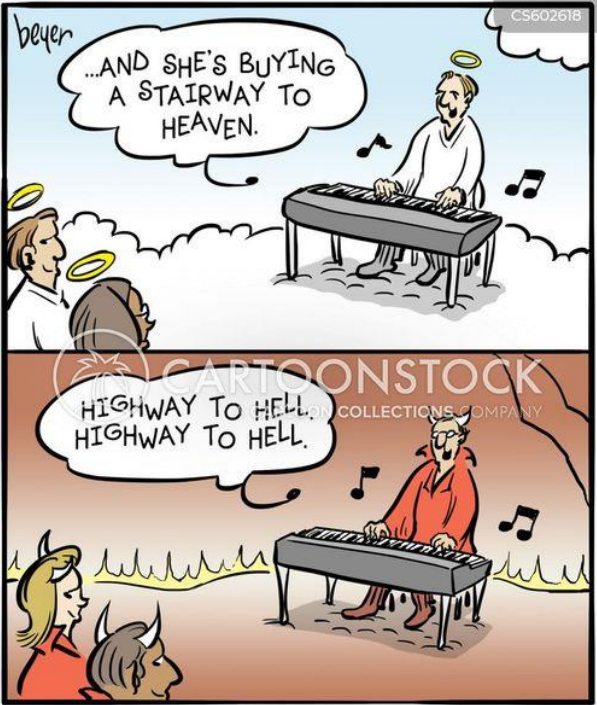
Standards Of The Afterlife

Songs are reproduced, projected, and streamed with permission under CCLI #1029838. Portions of the liturgy are Copyright © Thom M. Shuman 2017 Portions of the liturgy are copyright © Augsburg Fortress 2020 Portions of the liturgy are copyright © Joyful Harvest Church, ELCA 2020